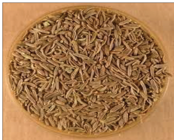
Figure 1: The seed of Cuminum cyminum

The dried seeds of Cuminum cyminum were collected from local region of Bhopal, Madhyapradesh, India.