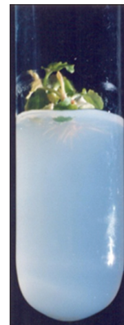
Figure 8: Rooting of plantlet