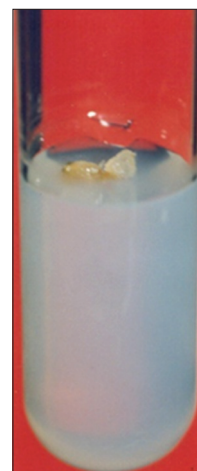
Figure 2: Callus development in petiole