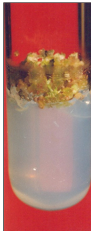
Figure 5: Active green petiole callus

*Subculture was carried out everytime after 7 days