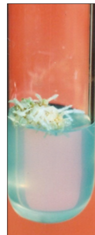
Figure 4: Fibrous root formation