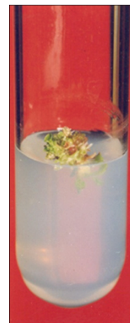
Figure 6: Shoot regeneration from petiole callus