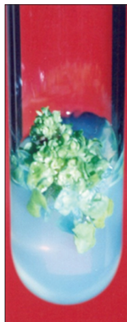
Figure 7: Multiple shoots