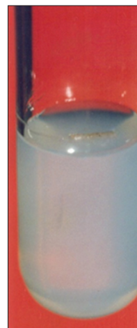
Figure 1: Petiole explant showing swelling

Petiole explants inoculated on MS plain medium and MS medium supplemented with Kn, BAP, IAA, IBA, and NAA, singly, in different concentrations, did not show any positive response toward callusing (data not given). However, the petiole explants inoculated on MS medium supplemented with 2, 4-D (6.78 and 9.05 μm) alone and in combination with BAP (6.66-15.53 μm) or Kn (6.97-16.26 μm) inducing the callus in petiole explants. Initially, petiole explants showed swelling after 4 days of inoculation [Figure 1]. After subculturing on the same medium, callus formation was observed within 7 days. The callus was initially developed at the ruptured portion in the groove and finally in the middle part of the explant. This callus was negligible, whitish and crystalline in nature [Figure 2]. On subsequent subculture on the same medium, callus grew in size [Figure 3]. MS medium with 2, 4-D (6.78 μm) was found best for callus induction from in vitro petiole explants with higher