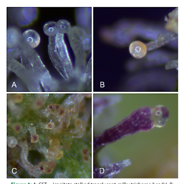
Figure 1: A: CST<sub>t-m</sub> (capitate stalked translucent-milky trichome heads), B: CST<sub>y-o</sub> (capitate stalked yellow-orange trichome heads), C: CST<sub>db</sub> (capitate stalked dark brown trichome heads) and D: purple coloration (probably from anthocyanins) in trichomes.

Changes in cannabinoid (CBDA, CBD, CBN, (-)- \Delta 9-THC and \Delta 9-THCA A) content of the analyzed samples from three spots - SE, CN and NW during the sampling period, are given in Table 3. All analyzed samples had levels of total CBDA below limit of quantification, throughout sampling time points. Additionally, CBD was not detected, therefore total CBD was insignificant.