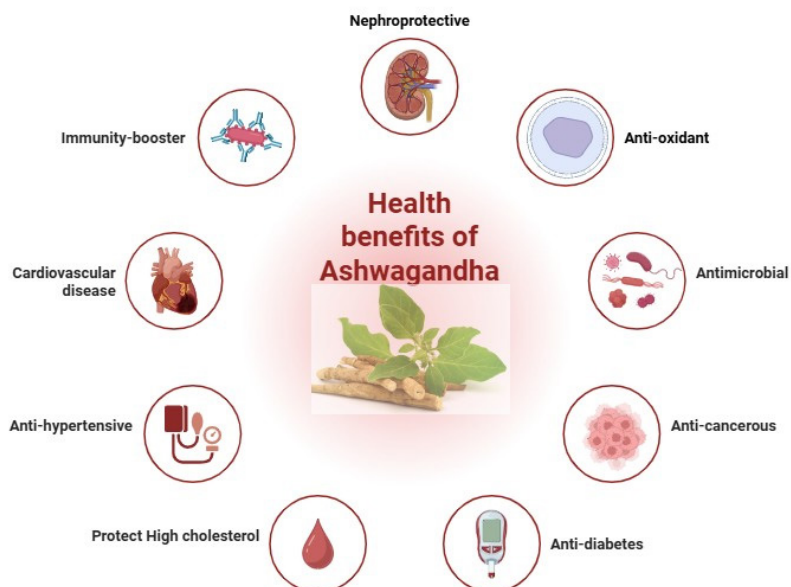
Figure 1: Multifaceted therapeutic properties of W. somnifera .

Chromatographic profiling, through various TLC methods, is very vital in qualitative assessment of primary active constituents in the medicinal plant. The prime active constituents of W. somnifera are withaferin A and B (Sangwan et al. , 2014). This profiling is followed by quantitative tests, namely HPLC and HPTLC, which aim to accurately evaluate the concentration of these major active principles. In this evaluation, withaferin A and B have been analyzed by measuring their respective amounts (Meena et al. , 2021). It seems to play an important role in identifying the possible adulteration of Withania somnifera by lower-grade species or exhausted plant parts (Cooper et al. , 2017). Table 4 provides detailed information, including Rf values and quantitative ranges for withaferin A, as well as the methodology outlined in various standard texts.