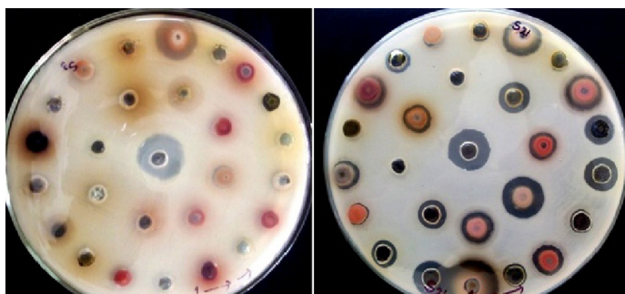
Figure 2: Antidandruff activity of Phyla nodiflora by zone of inhibition using agar cup plate method.